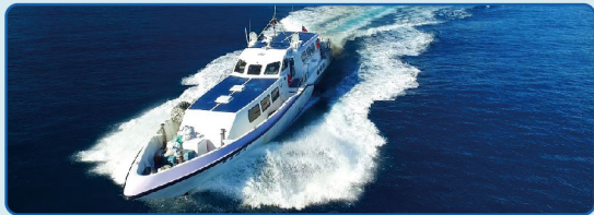
Double Lucky Tainan ▶ Penghu, South Penghu Marine Jiangjun ▶ Dongji, and National Park