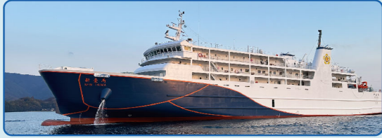
New Taima Keelung ▶ Matsu