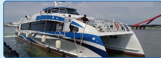
Fei Ma 3 Donggang ▶ Xiao Liuqiu