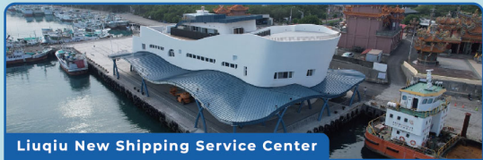
Liouqiu New Shipping Service Center

A transshipment hub for travel from Taiwan to Green Island and Lanyu. A newly upgraded travel space, optimizing passenger flow. Ticket counter provides more convenient ticketing and travel information services. The start of an unforgettable ocean journey.