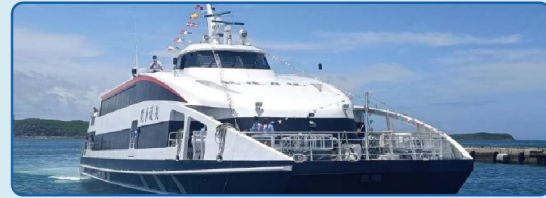
Kai Shuan No.8 Budai ▶ Magong