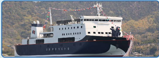
Pengeru Kaohsiung ▶ Magong