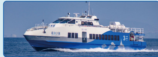
Leuco Sapphire No. 3 Donggang ▶ Xiao Liuqiu