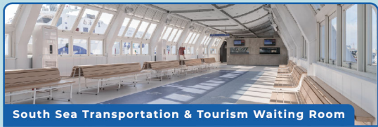
South Sea Transportation & Tourism Waiting Room