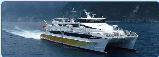
Blue Magpie Budai ▶ Magong