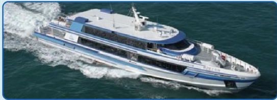
South-North Star 2 Taipei ▶ Matsu