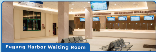
Fugang Harbor Waiting Room

Spacious, comfortable waiting area with special area dedicated to children's games. Accommodates 2,000 people at a time, with local art from Chiayi. Relaxing atmosphere provides passengers with a convenient travel center.