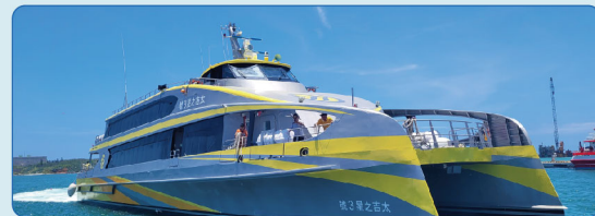
Tai Ji Jih Sing No. 3 Budai ▶ Magong

TAIWAN Hi Marine Highway 交通部航港局 Maritime and Port Bureau, MOTC