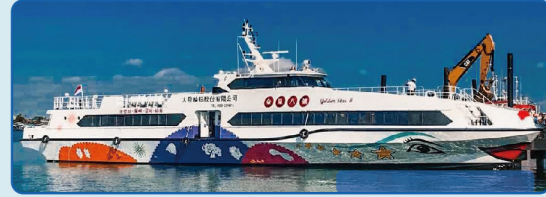
Golden Star No.8 Taitung ▶ Green Island, Lanyu